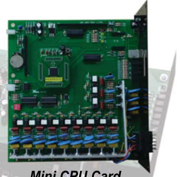
Mini CPU Card