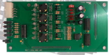
4G Detector Card